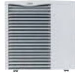
aroTHERM air source heat pump